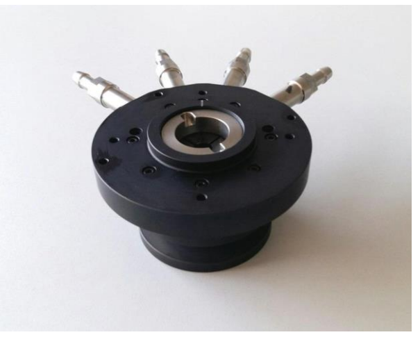
Heat exchanger unit made of stainless steel