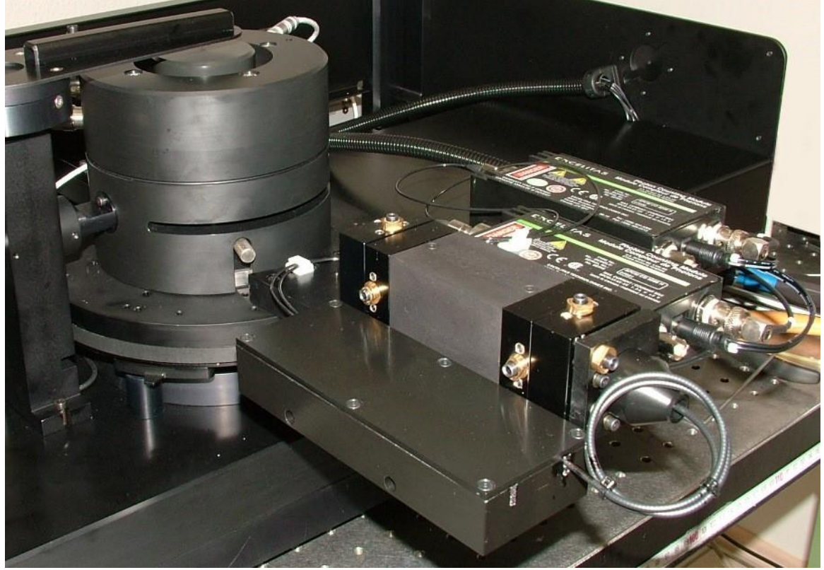
Detection unit with PseudoCross Correlation Setup consisting of two ALV-High Q.E. APD units