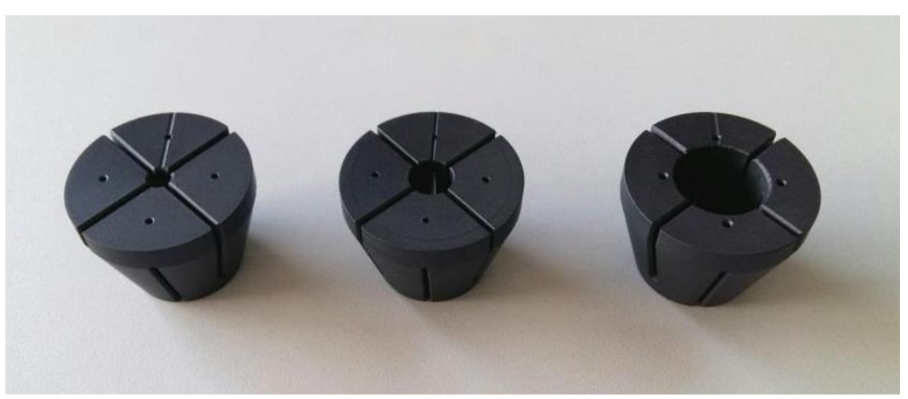
Cuvette holders for cylindrical cuvettes with outer diameter of 5.0mm, 10mm and 20mm.

(1) The temperature range given above is the absolute max. allowed temperature range for which the ALV / CGS-3 will keep it's alignment to the required precision. For measurements at high temperatures, special fluids for the waterbath circulator must be used (e.g. glycol or mineral oils). <u>Silicone oils must never be used as circulator fluid any time !</u> Likewise, special fluids must be used as index matching fluid for temperatures larger than approx. 45°C. <u>Silicone oils must never be used as index matching fluid any time !</u>