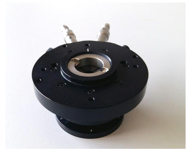
Heat exchanger unit made of aluminum

For working temperatures above 80°C up to 90°C an additional heat exchanger must be integrated in the base plate of the ALV/CGS-3 System.